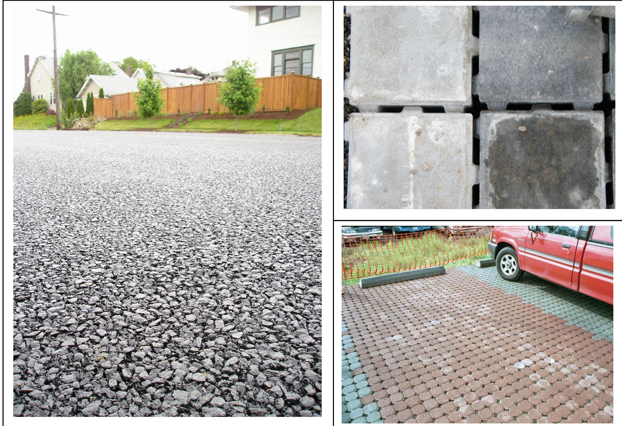
Left: porous asphalt mix. Top-right: SF RIMA™ pavers. Bottom-right: Uni Eco-Stone® pavers

Porous pavements, which may also be referred to as permeable or pervious pavements, allow rainwater to pass directly through the paving surface into gravel layers below, where it slowly infiltrates into the native soils. To avoid confusion with the term impervious, this manual refers to all pervious or permeable pavements as “porous pavement.”